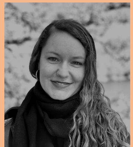
Sia (she/her/they) German, English, Swedish, French