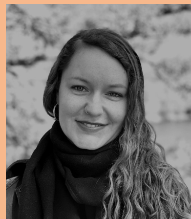
Sia (she/her/they) German, English, Swedish, French